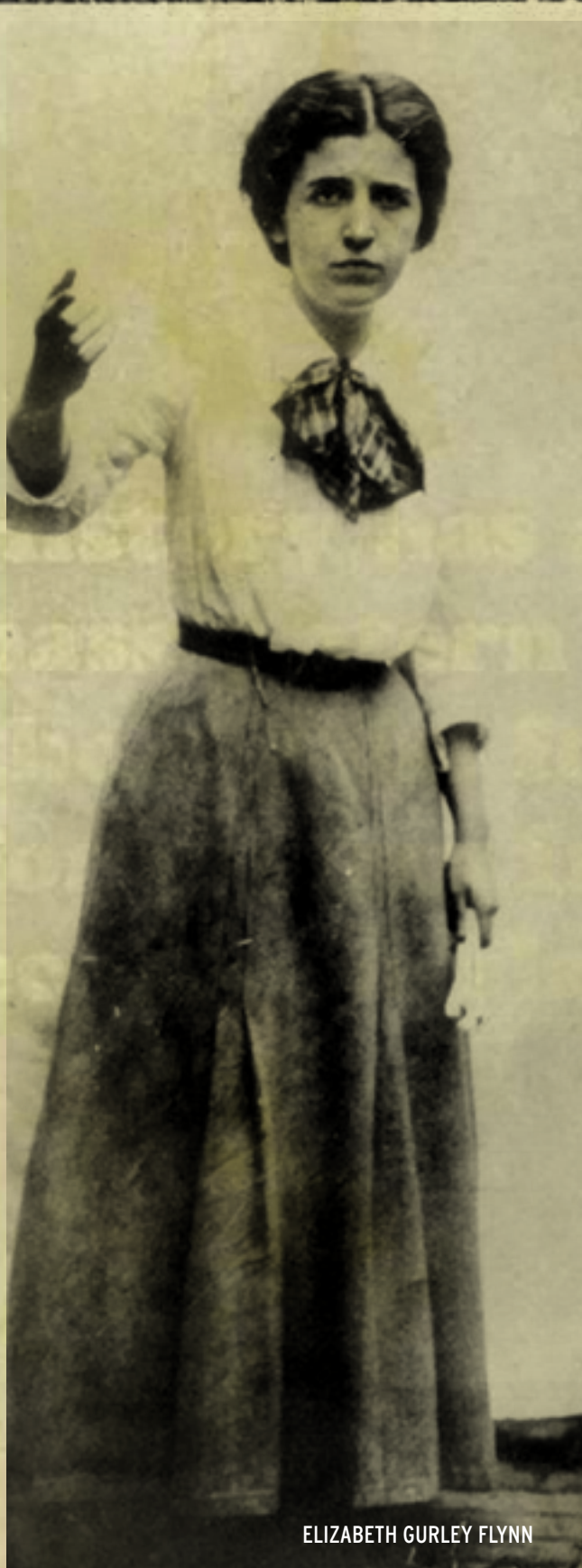
ELIZABETH GURLEY FLYNN