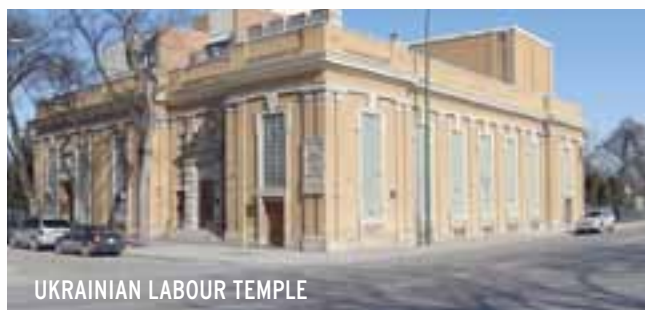
UKRAINIAN LABOUR TEMPLE

For more information please call the Winnipeg Labour Council at 942-0522 or email info@winnipeglabour.ca .