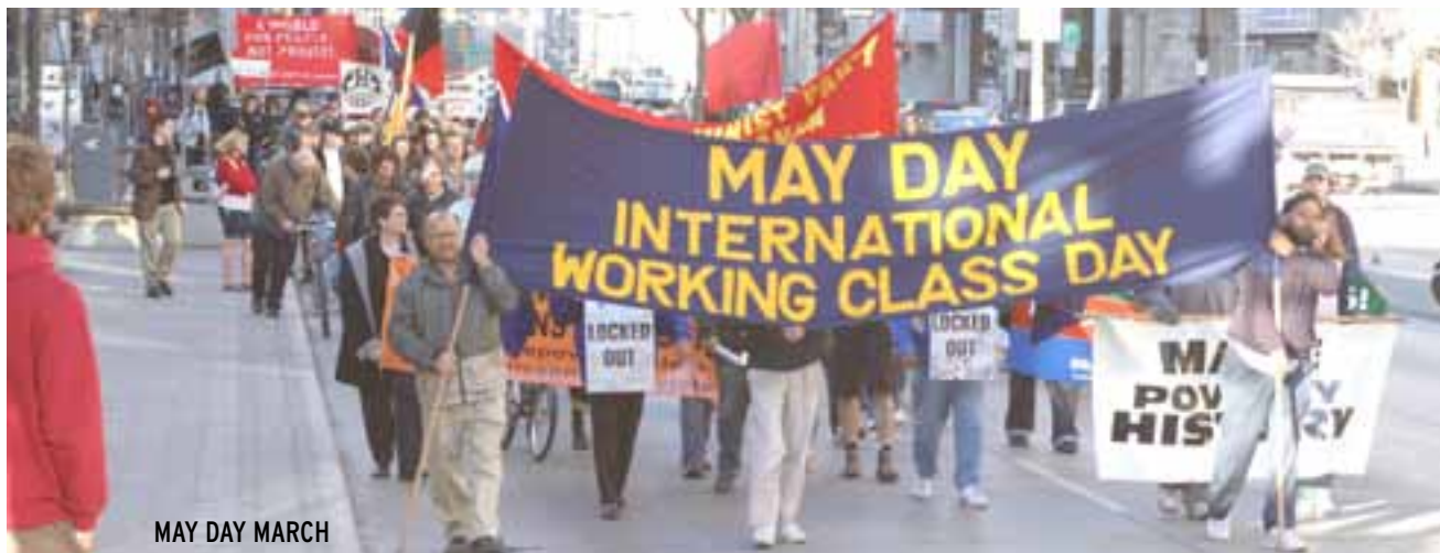
MAY DAY MARCH